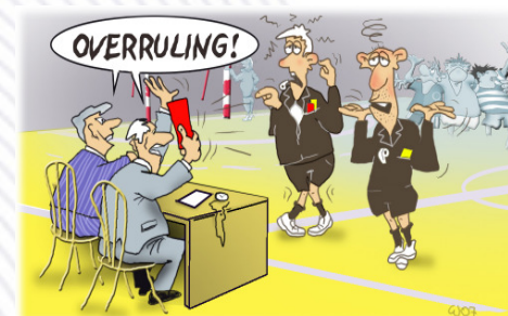
Rules, Regulations & Officiating