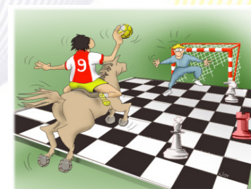
Handball Vision, Mission & Strategies