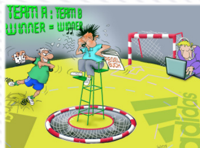
Game Development, Research & Facilities