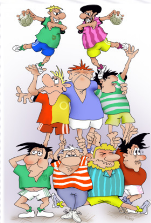
Competition Cycle, Calendar & Format