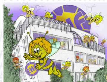
Cooperation with the EHF