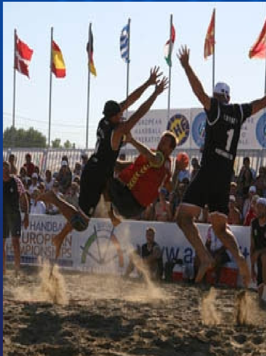
European Handball Federation

The type of relation you establish with everyone can help you have the type of atmosphere that you want during your match.