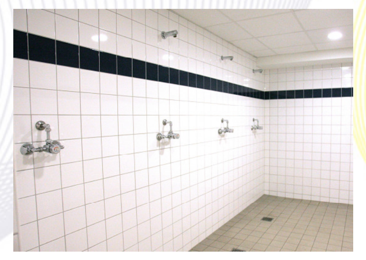
European Handball Federation