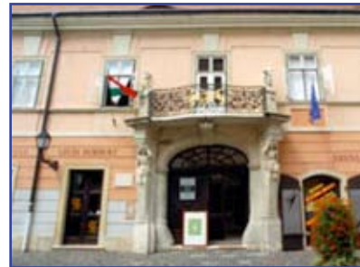
... Esterházy Palace and Art Museum