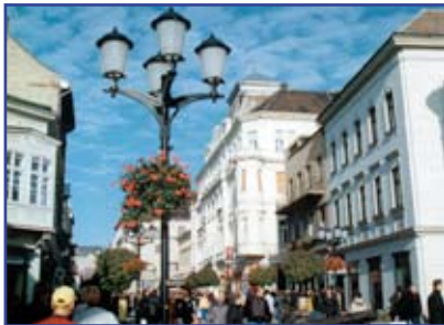
...the heart of the city: Baross street