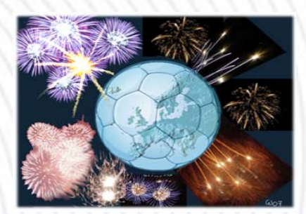
Event Management TV & Media