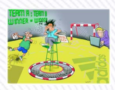
Game Development, Research & Facilities