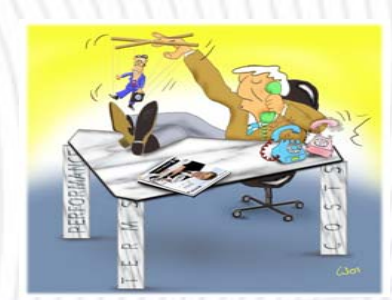
Daily Business Marketing