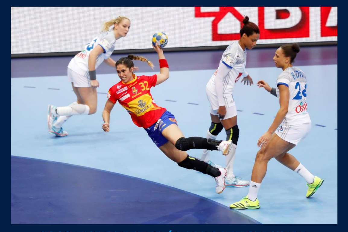
2018 EHF REFEREE / DELEGATE SEMINAR 31 August – 1 September 2018 in Vienna, Austria