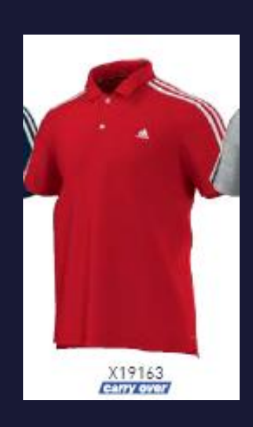
Ess 3S Polo