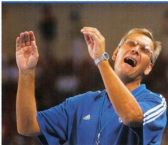
Wiederholt abfällige Gesten nach Schiedsrichterentscheidungen