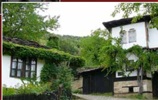
"Bozhentsi E333" by Elena Chochkova - Own work. Licensed under CC BY-SA 3.0 via Commons.