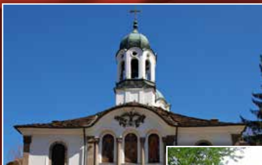
"Dormition of the Most Holy Mother of God Church Gabrovo TB1" by Todor Bozhinov - Own work. Licensed under GFDL via Commons.

City's most successfully sports club is FC Yantra Gabrovo, which was founded in 1919. The city also has long handball traditions. About 25 km (16 mi) from the city in Central Balkan Mountains is located the renowned winter resort Uzana.